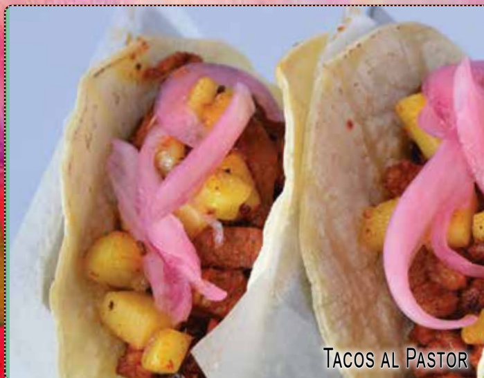
TACOS AL PASTOR