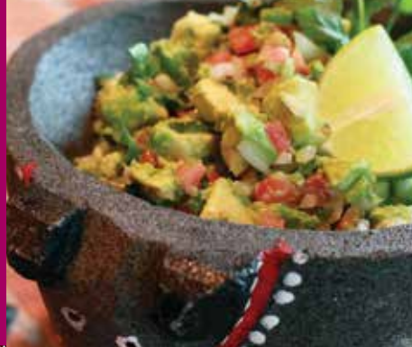
TABLE SIDE GUACAMOLE

Chicken quesadillas, beef nachos and chicken flautas. Served with fresh guacamole, sour cream, pico de gallo, jalapeños and cheese dip – 13.25