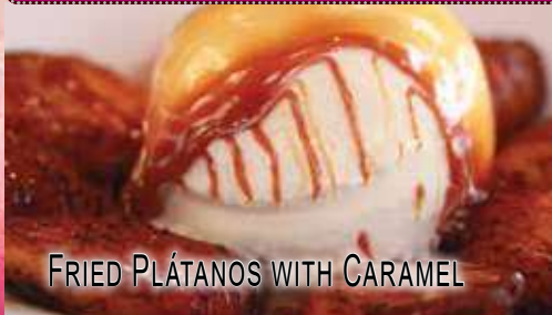
FRIED PLÁTANOS WITH CARAMEL