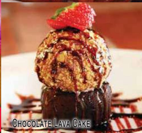
CHOCOLATE LAVA CAKE